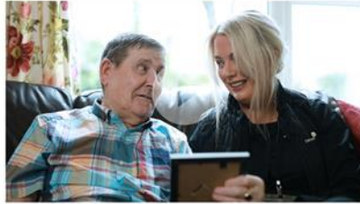
Not all heroes wear capes