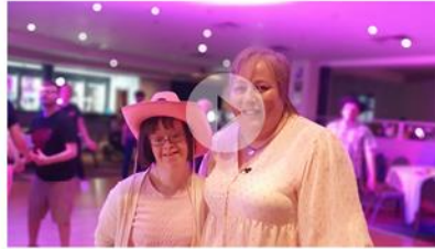
Food for the soul