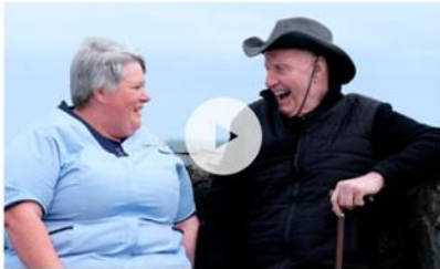
Doing What You Enjoy