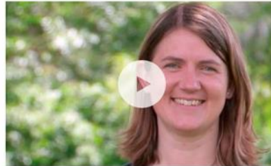
A Philosophy of Caring