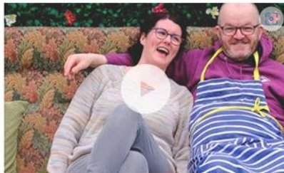
You Can Do it