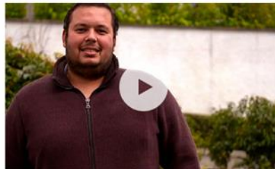
Hospitality to Care