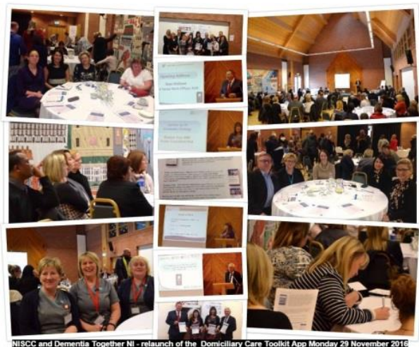
NISCC and Dementia Together NI - re-launch of the Domiciliary Care Toolkit App Monday 29 November 2016