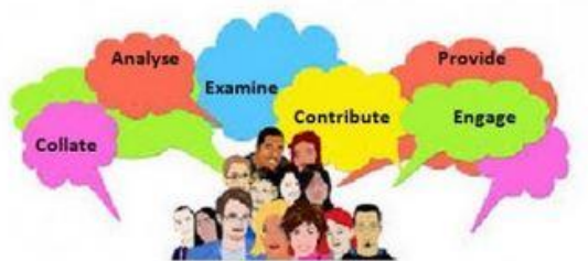
NISCC Social Care and Early Years Qualification Panel (SCEYQP)

Health and Social Care Qualification Review Reference Group